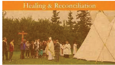
Healing & Reconciliation